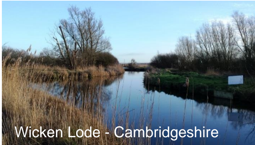
Wicken Lode - Cambridgeshire