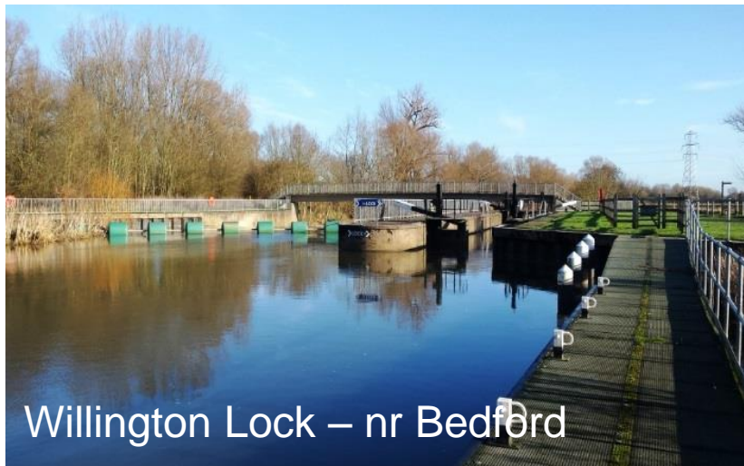
Willington Lock – nr Bedford