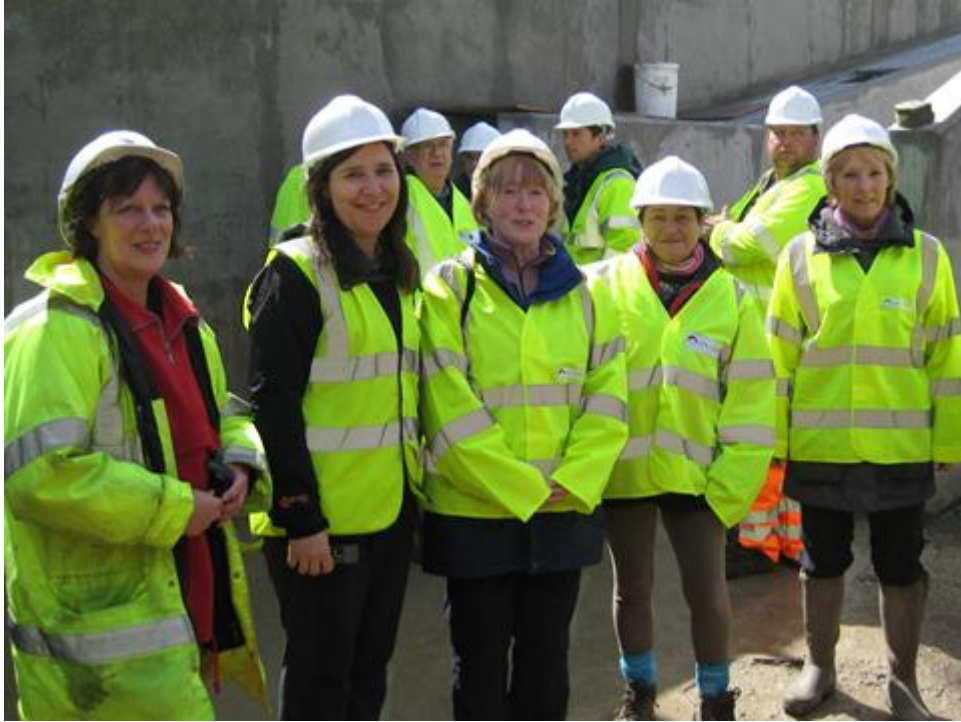
Canal & River Trust Staff and Volunteers

New weir and fish pass have now been installed at Cooper Bridge which will greatly alleviate the potential for flooding further down-stream as well as assisting fish travelling to their spawning grounds.