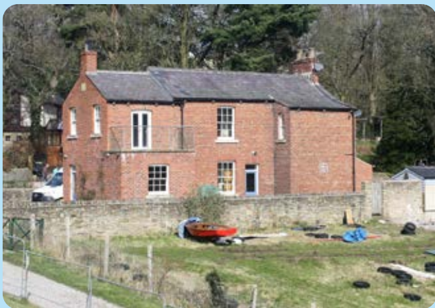
Above: Toddbrook Lodge will be preserved.

The former Victorian reservoir-keeper's house, Toddbrook Lodge, has been acquired by the Trust and will be carefully preserved. It will initially serve as a site office for the construction works.