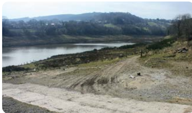
Above: Site of the new structure on the north side of the dam.