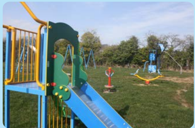
Above: New replacement play equipment will soon be available next to Whaley Bridge Athletic Football Club.

end of the project in 2024, a new playground, similar to the existing one, will be rebuilt at the same location in the Memorial Park. The park will also be re-landscaped with replacement trees, wildlife habitats, extra paths and a new footbridge over the bypass channel. The project will achieve a net biodiversity gain of more than 10%.