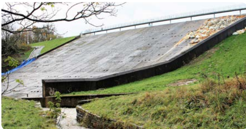
Left: Concrete panels from the 1970s spillway, damaged in summer 2019, will be removed. The dam will then be repaired and grassed over.