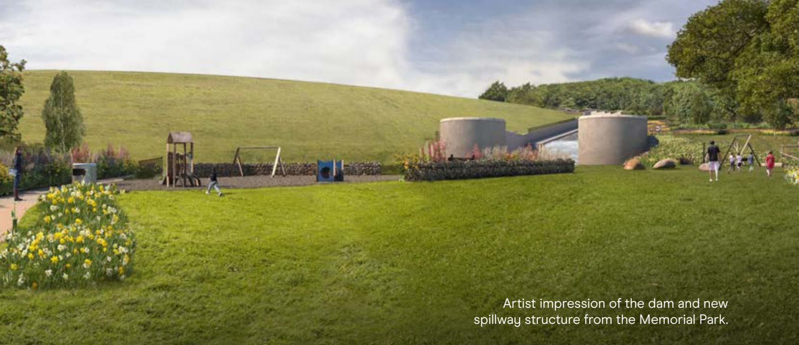
Artist impression of the dam and new spillway structure from the Memorial Park.