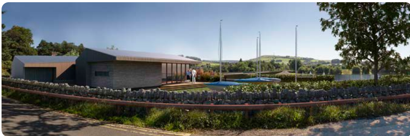
Above: Artist impression of the new Sailing Club.