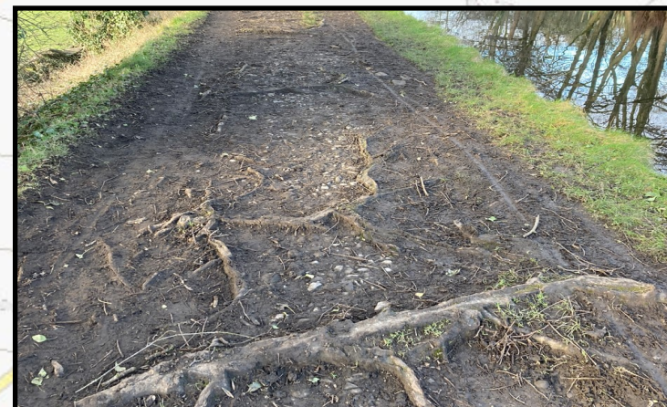
Tree roots to be protected or avoided to avoid tree loss