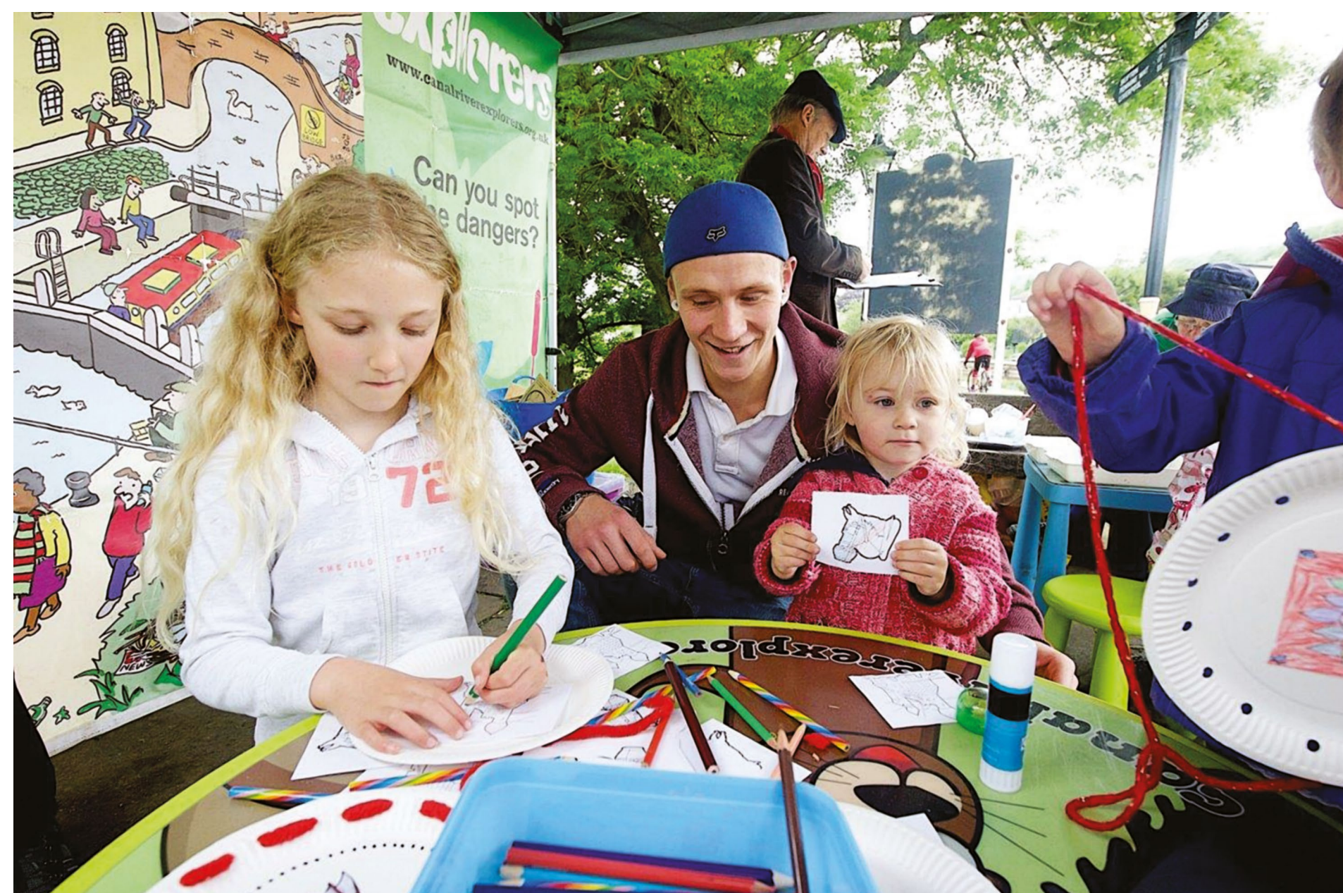
Canal & River Explorers is the main learning programme of the Canal & River Trust, for primary schools and groups such as Cubs and Brownies.

Find out more at canalrivertrust.org.uk/explorers