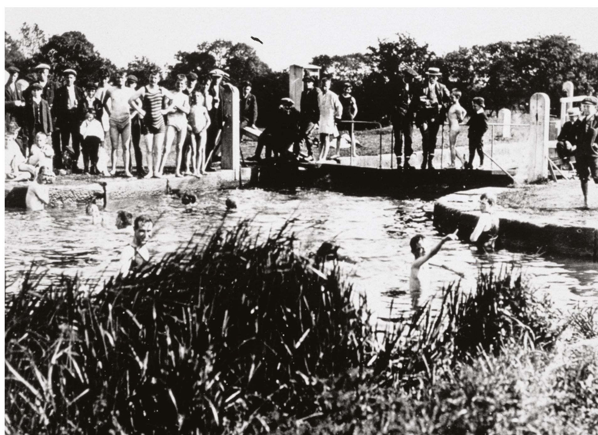
Local men and boys swimming at Silburn Lock c1915. Sheila Nix MBE