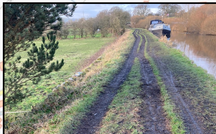
Existing muddy state of towpath