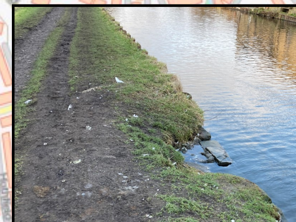
Damage to canal wash walls to be repaired