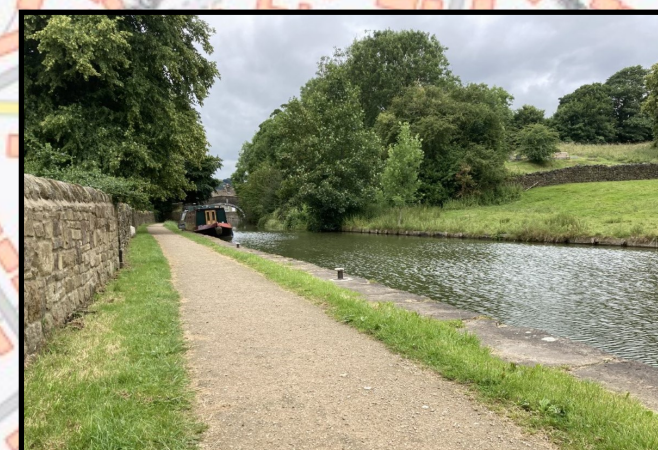
Existing towpath in Kildwick