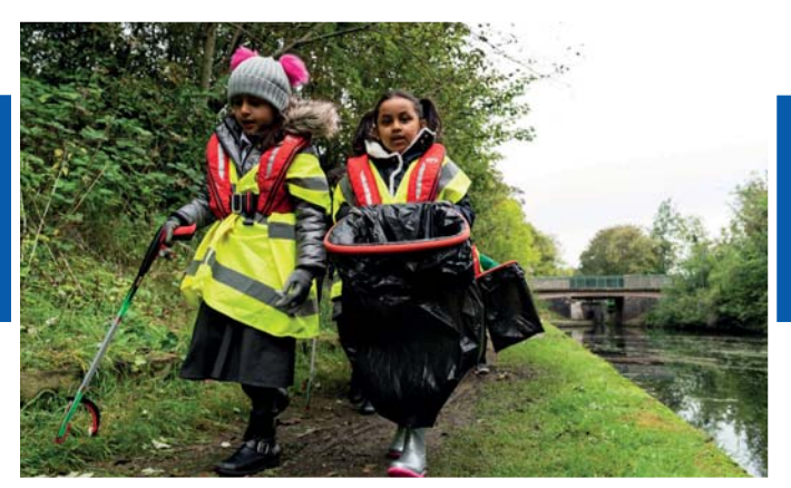
Quotes from Barrow Hill Junior School pupils