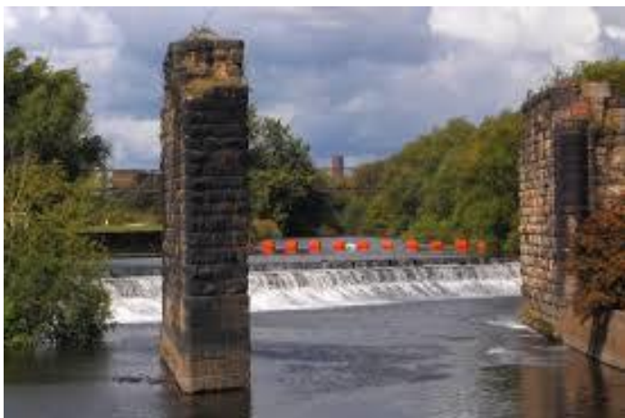
Knostrop weir - a fish pass needed here!

In theme seven , we are looking to improve the opportunities for upstream and downstream fish movement at structures along the waterway, incorporating salmon and eel fish passes: