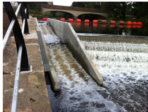
Cooper Bridge with salmon and eel pass