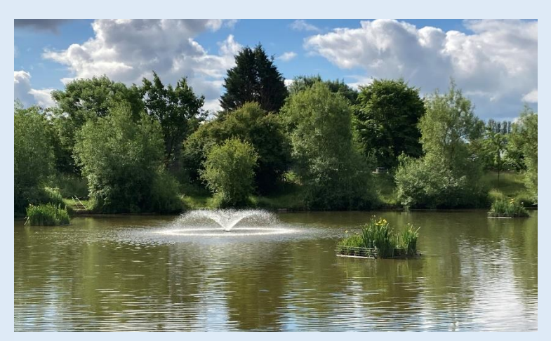
Some of the newly constructed floating reed islands at Top Barn Fishery.

Another venue that enjoyed AIF support was Top Barn Fishery who were granted £2185.45 towards the cost of 6 floating Islands. The fishery was suffering from serious predation caused by cormorants as well as grebes, and a survey revealed that they were incurring substantial silver fish losses. Working in partnership with the Angling Trust and a private contractor, the installations have provided protection and cover, enabling stocks to thrive once again.