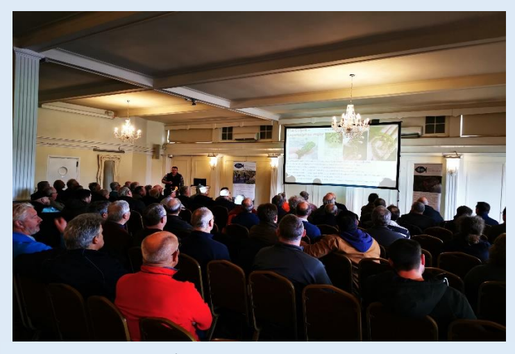
Attendees at the IFM's Kettering aquatic weed control workshop.

Whilst there is no doubt that 'virtual' events do have their place, moving forward the IFM are hoping to revert back to the more 'traditional' workshop as it was felt that many delegates are better able to share their problems and solutions with each other.