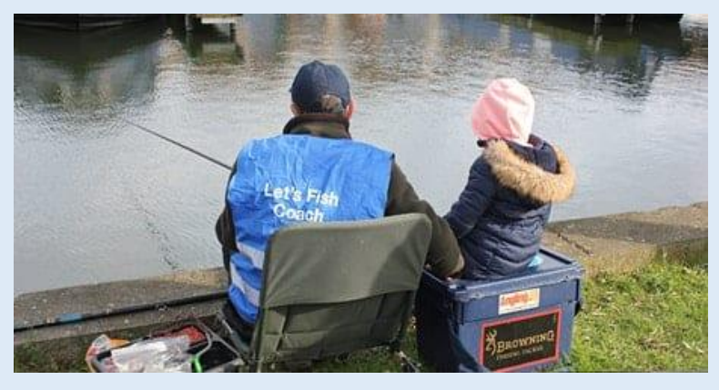
A CRT Let's Fish event in full swing.

Despite differing results the qualitative element of this study revealed a number of positive effects of a Let's Fish session, therefore suggesting that the programme brings benefits to participants as a whole.