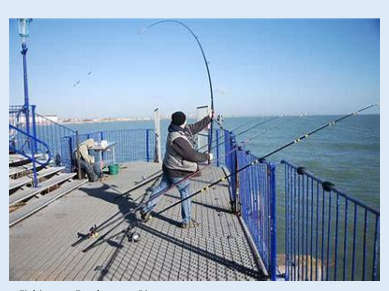
Fishing on Eastbourne Pier.

The Defra led Recreational Sea Fishing Forum (RSFF) which brings together the recreational sector, regulators and policy makers to shape sea fishing policy will be key in helping promote the new fund. Defra's Grant Horsburgh said, "for the first time the recreational sea fishing sector now has a designated fund that they can bid into to help develop projects that will promote sea angling participation and help grow the industry. This in turn will hopefully lead to additional positive effects in the local economies via investment through angling tourism."