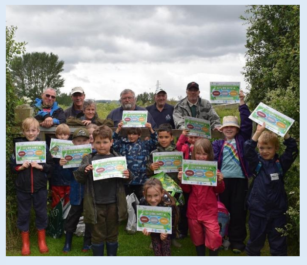
Youngsters with their Get Fishing awards

For more information, please go to <a href="https://www.anglingtrust.net/funding/get-fishing-fund/">www.anglingtrust.net/funding/get-fishing-fund/</a>