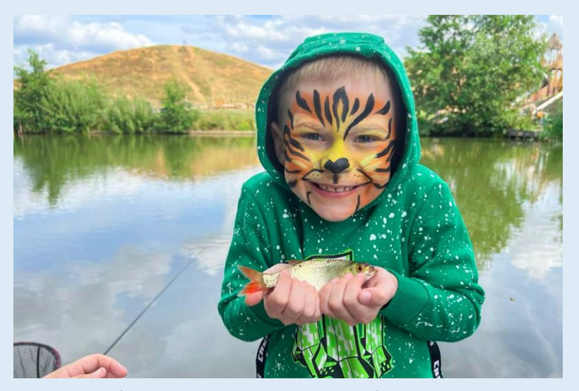
Fishing and face painting – possibly the most fun you can have!

In 2021/22 GHoF have been very active providing a mixture of social inclusion, family and community orientated angling events around the country. This year they have worked with close to 10,000 children and adults across a wide range of ages, cultures and socio-economic backgrounds. They have also worked with a diverse range of partners reflecting the scope of their work, including; Mainstream schools, special schools, alternative education providers, Child and Adolescent Mental Health Services (CAMHS), Local Authority Family Services, community groups supporting recovering drug and alcohol addicts and the homeless.