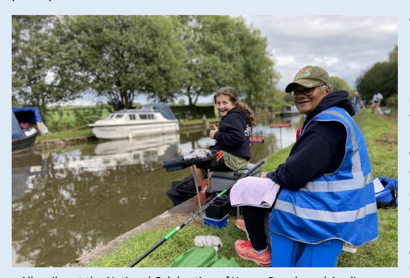
All smiles at the National Celebration of Young People and Angling

Let's Fish believes the concept of team and healthy grass roots fun-based competition is an area that has been neglected in angling participation programmes for several decades. With administrative support from Angling Trust, CRT through 'Let's Fish' invested a total of over £14,000 hosting the 2021 national celebration of young people and fishing with a number of regional events feeding participants into the national celebration.