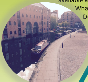
Rochdale Canal Lock 92

Towpath mooring is also available at Paradise Wharf, between Ducie Street and Store Street Aqueduct.