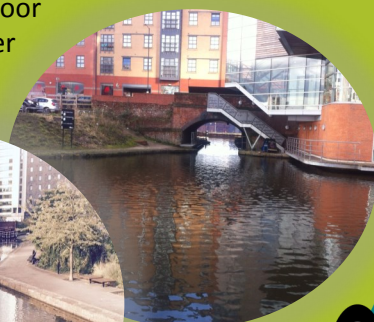
Dale Street Basin