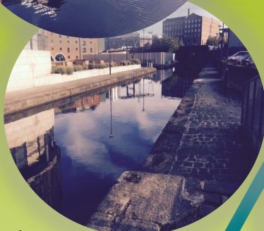
Rochdale Canal Lock 84